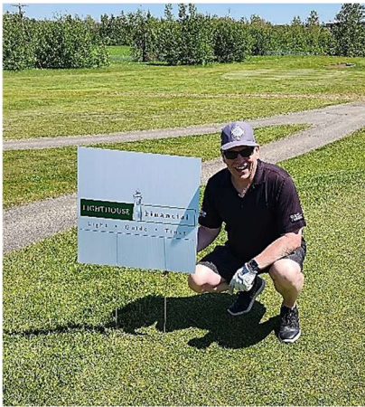
Parkland Immanuel Christian School Fall Classic, Sept 7, 2024, The Ranch Golf & Country Club

commercial kitchen and dining area, and a large common area.